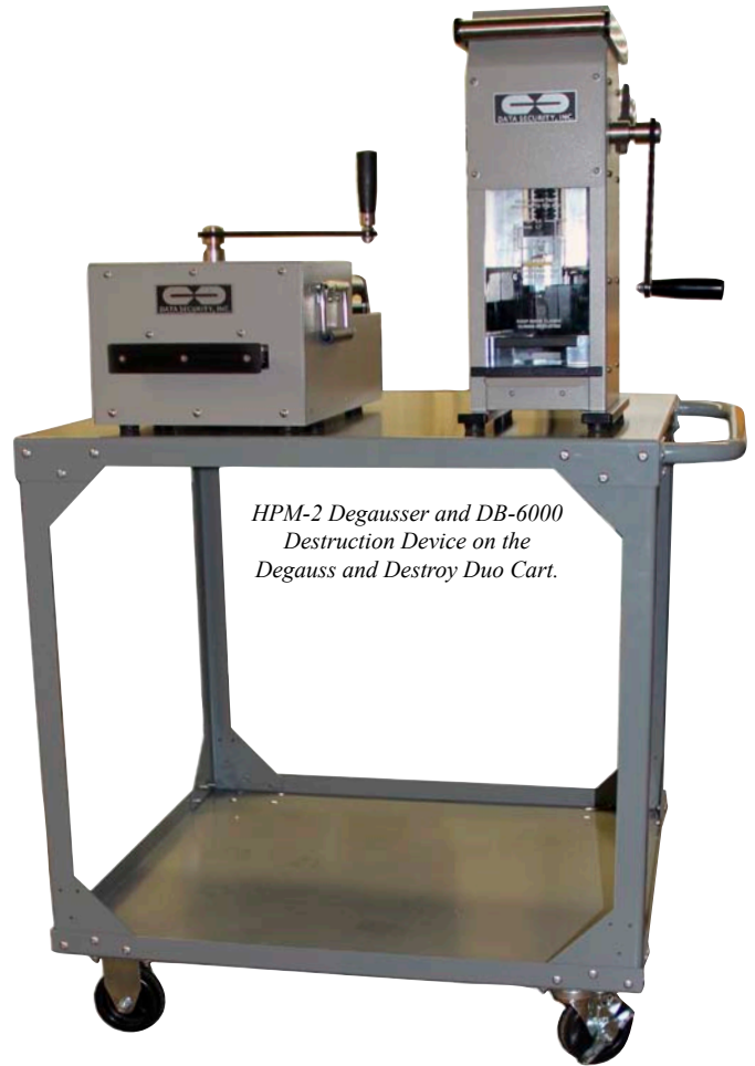
HPM-2 Degausser and DB-6000 Destruction Device on the Degauss and Destroy Duo Cart.

For complete compliance with NSA specifications, combine any Data Security, Inc. degausser with any Data Security, Inc. destruction device.